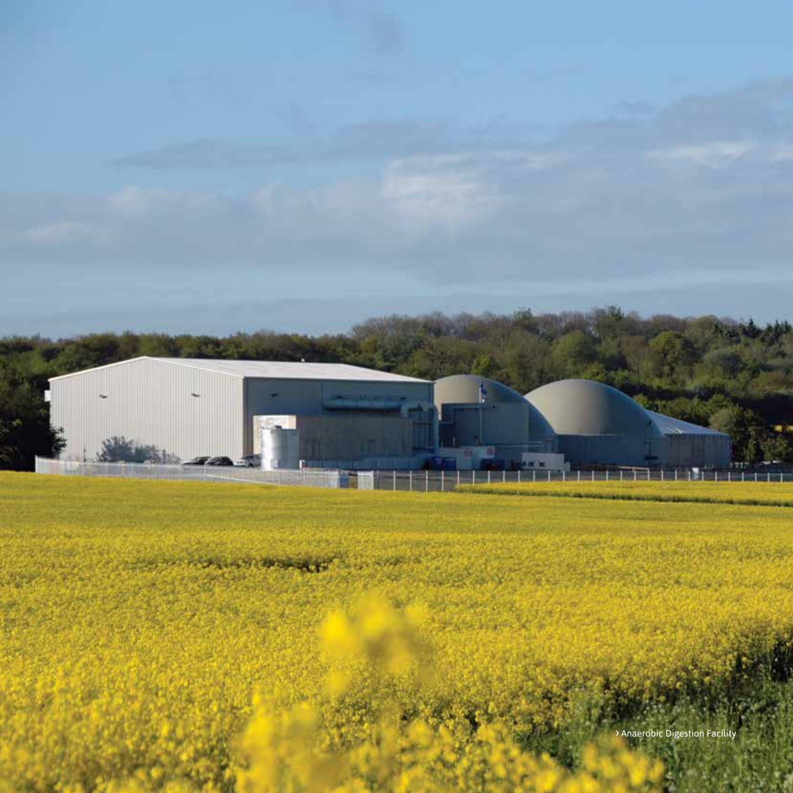
› Anaerobic Digestion Facility